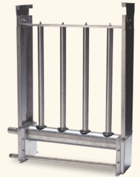
SAM-e Short Absorption Manifold